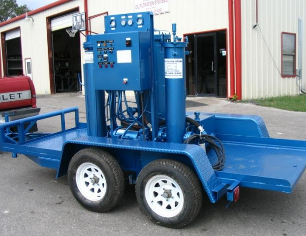
Trailer Mounted Coalescer Oil Purification System